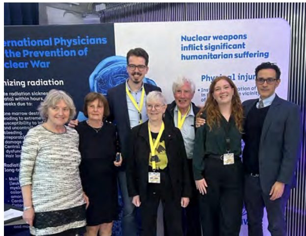
IPPNW Team in Brussels

Brussels and Oslo: IPPNW physicians, medical students, and staff members gathered in Brussels and Oslo in April for NukeExpo , an immersive and interactive conference on the dangers of nuclear weapons, hosted by International Committee for the Red Cross and Norwegian People's Aid. IPPNW Co-President, Dr. Carlos Umaña, addressed the first plenary in Brussels, defending the Treaty on the Prohibition of Nuclear Weapons as ultimately more realistic and reliable than continuing to depend upon nuclear deterrence and unstable leaders to prevent nuclear war indefinitely. IPPNW ran education stalls in the “impacts” and “response” sections of the exhibition, focusing on the humanitarian impacts of nuclear weapons and the inability of health services to adequately respond to any use of these indiscriminate weapons. We hope to replicate the expo in other key countries.