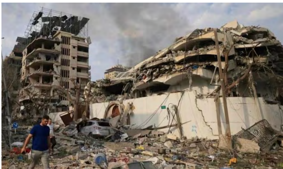
Al Ahli Arab Hospital-Gaza

IPPNW calls for a ceasefire in the Israel-Palestine war. Our goal is the health, peace and security of all people, whether they live amid the terror and destruction of war. Our profession has its roots deep in our ethical obligation to provide care to all on the basis of their shared humanity and their need.